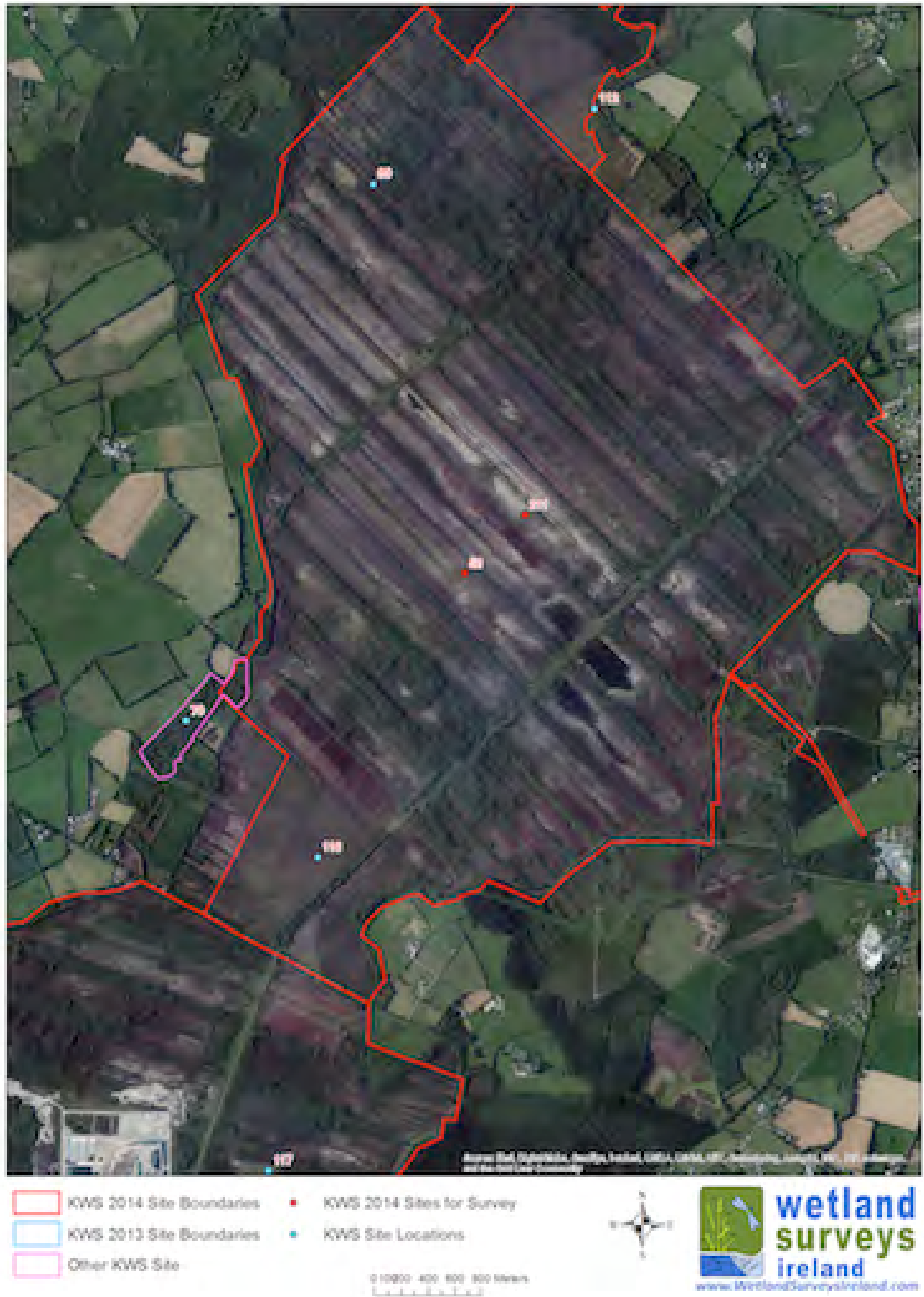
Figure 1. Aerial photograph showing the appearance and location of site shown by the site code and red outline (where appropriate). Aerial photograph copyright Ordnance Survey of Ireland.

Maps are reproduced under OSI License number 2004/2009 CCMA Kildare County Council. Unauthorised reproduction infringes Ordnance Survey Ireland and Government of Ireland copyright. © Ordnance Survey Ireland 2014.