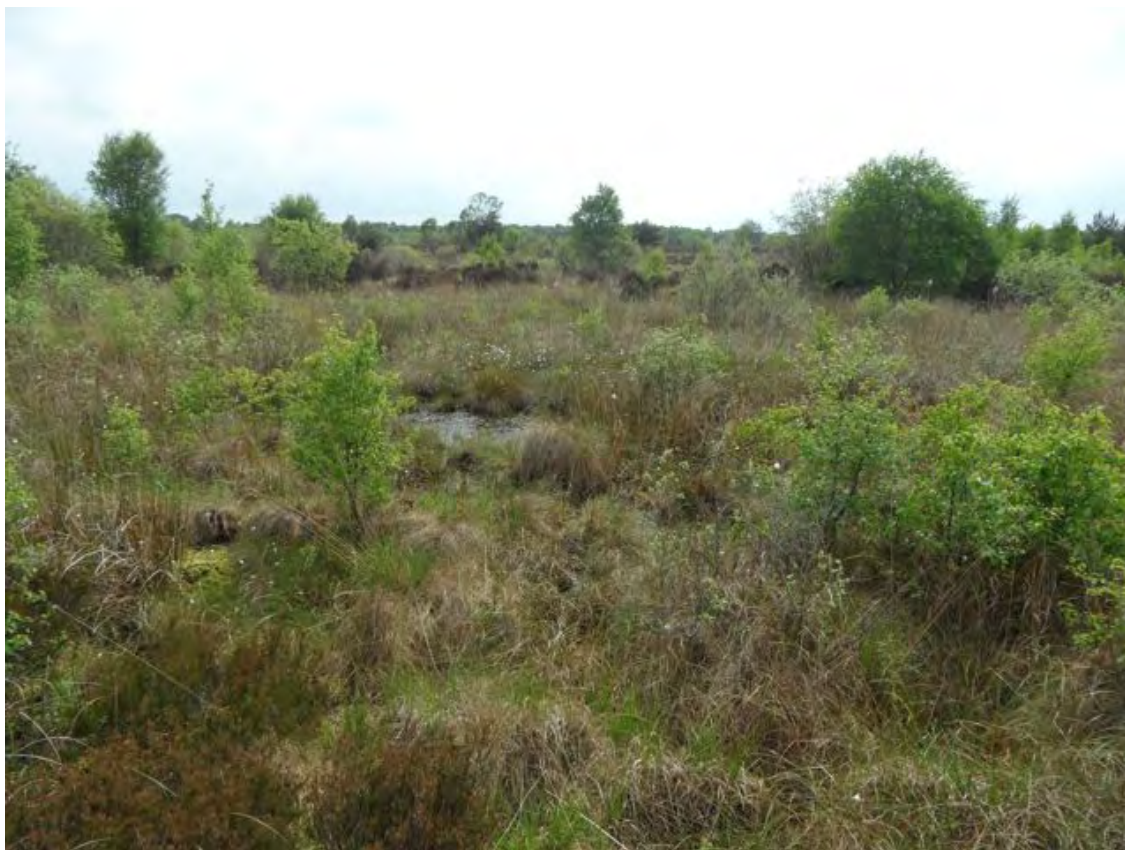
Photograph 1. Timahoe North, County Kildare showing an area of cutaway bog where natural regeneration has occurred. Small wetland areas surrounded by poor fen, heathy and regenerating bog vegetation, birch scrub and woodland are common.

Site Code: KE211 Area (ha): 807.29 Grid Ref: 276100 234938 County: KE